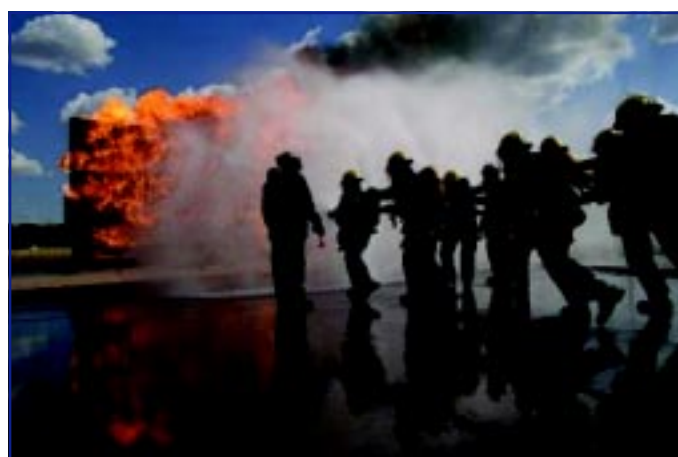
The image to the right shows part of the unique Incident Ground at the Gloucestershire facility and the others show an assortment of training exercises held at the Moreton in Marsh College.