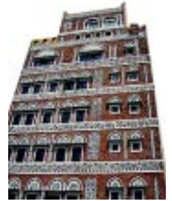
Burj Al Salam