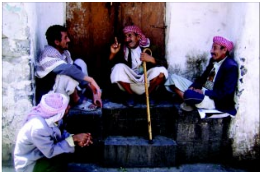
Men at Work

Instead of staying at overpriced and inconvenient international hotels on the outskirts of town - stay in the Old City – designated a UNESCO World Heritage site. The hotels will arrange a driver to pick you up from the airport and it is about a twenty minute journey into the centre of the Old City – cost $20 or SR75.