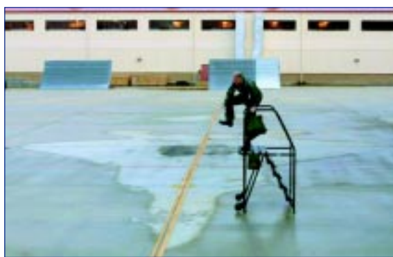
Right: Latest model of the Stealth Fighter about to take to the air