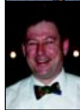
Owain Raw-Rees Events