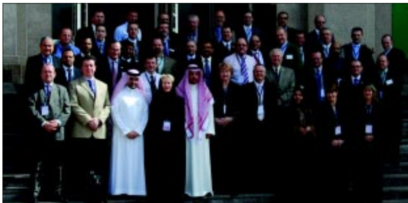
The Eastern Province paid host to three separate Trade Missions when more than 50 British companies took part in British Week in April. The party above are assembled on the steps of the Alsharqia Chamber of Commerce.

On the social scene, our annual Summer Ball was held on 6 June at the Golden Tulip, Bahrain and once again it seems a great time was had by all. The regular Khobar quiz nights and the Jubail social program continue to be well supported. For this year’s Winter Ball, BBA is looking to join forces with the Bahrain