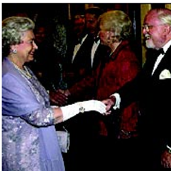
Her Majesty Queen Elizabeth II graciously attended the 50th Anniversary Royal Gala Performance on 25th November 2002, pictured here with Lord Attenborough, one of the show's original stars.

Chances are that, once the delight of not having guessed wears off, The Mousetrap will fade in your memory. When you plan your next trip home or to the UK make sure you include this one in your travels.