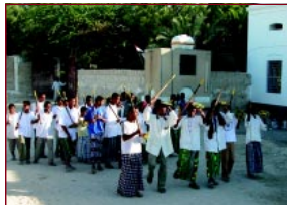
Pictures left & below show the visitors being welcomed at the school

The opening of the classrooms coincided with the inauguration of additional toilet facilities at the school and a Sewing Centre outside Mukallah also built from funds raised and directed by FoH. As can be seen from the photographs, children from the school welcomed the visitors in song and dance some of which bore a remarkable resemblance to ‘Morris’ dancing.