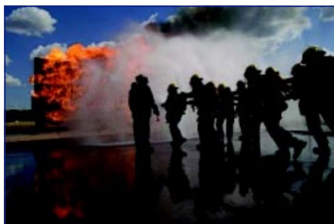
The image to the right shows part of the unique Incident Ground at the Gloucestershire facility and the others show an assortment of training exercises held at the Moreton in Marsh College.